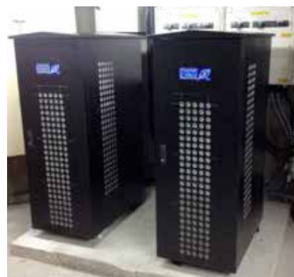
2x 80kVA High Internal Protection IP42 UPS supporting residential lifts in the UK

Four service meters track critical areas within the UPS alerting that maintenance is required.